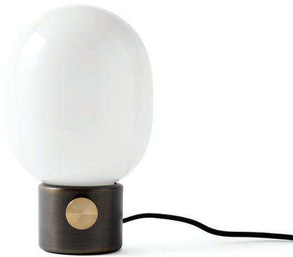
Bronzed Brass 1800859