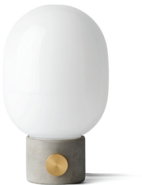
Light Grey 1800129