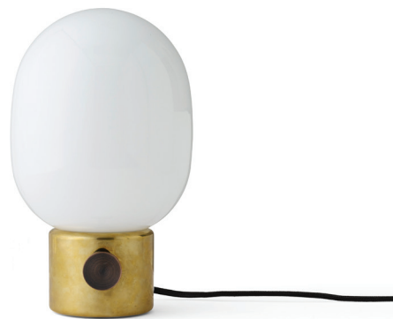
Polished Brass 1800839