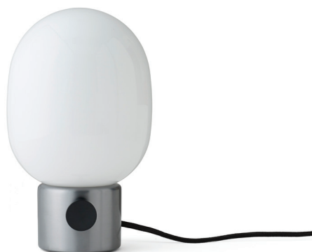
Brushed Steel 1800039